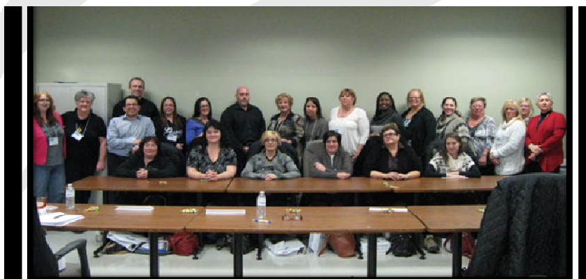
A “class picture” taken on the final day of TIP training in Wallaceburg , January 2014

I still need to know... “how to use Appreciative Inquiry on a regular basis – takes practice”